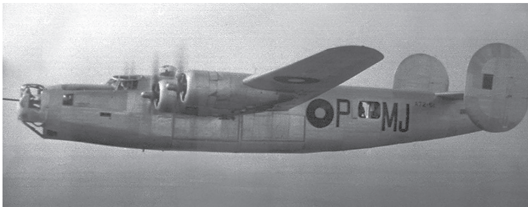
RAAF Liberator A72-61, identified as part of No. 21 Squadron because of the "MJ" fuselage code. No. 21 Squadron became operational at Fenton in January 1945. (Bob Livingstone)

Bombed secondary tgt Kairotoe strip ... 48 x 100 lb demos. All bombs in strip area – nil sightings – 2 bursts of A-A from Village near strip.