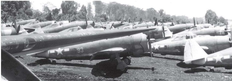
End of the road for dozens of "razorback" Thunderbolts ready for scrapping at Nadzab in late 1945. A close examination reveals representation from nearly every Fifth Air Force Thunderbolt group.