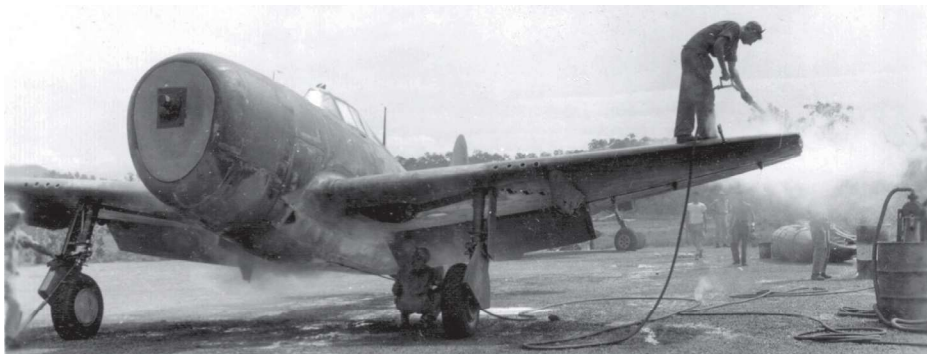
Cosmoline inhibitor is washed off the airframe of a new P-47D-16 just assembled by the 27 th Air Depot at Seven-Mile 'drome, Port Moresby, in early 1944. These boxed airframes were unloaded at Tatana Wharf, before being delivered by truck along Baruni Road for assembly.