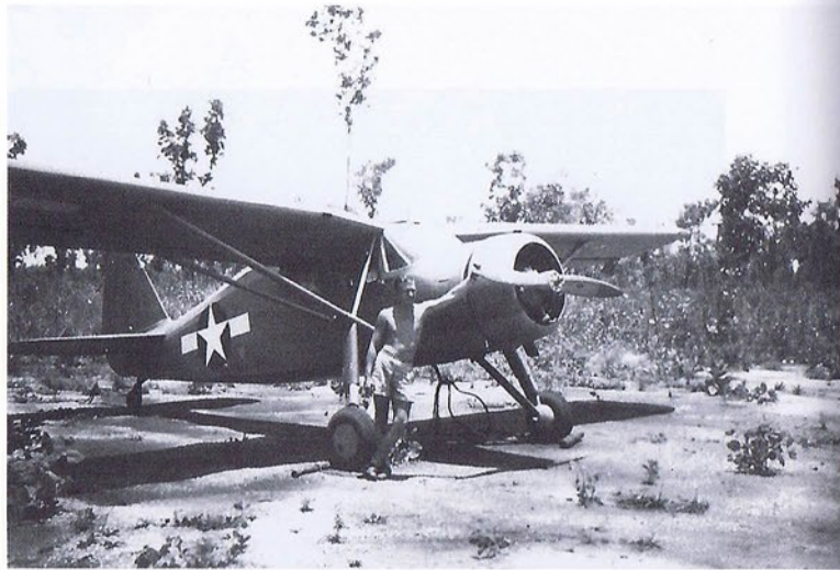
“Stumpy” (one of the mechanics) and The Fairchild at Fenton.

purchased in Australia or flown out from the United States. This was later destroyed in one of the Japanese attacks on Fenton.